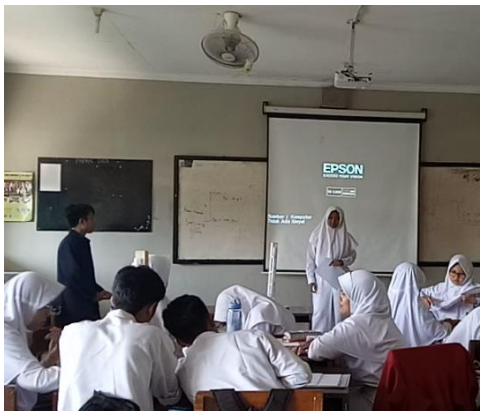
Figure 3. The student are presenting the results of the observations that have been discussed with the group.

In the Figure 2 above, it seems that students are completing projects related to the phenomenon of momentum. The last phase is assessment and evaluation results. In this phase, each group discussed and presented the observations that have been made as shown in Figure 3.