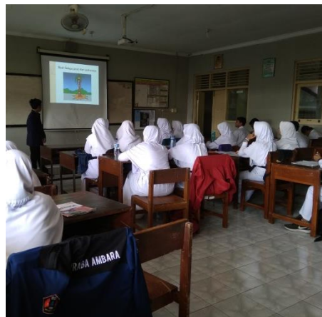
Figure 1. The teacher is doing apperception

In this study, to test the effect of PjBL based on the ability of creative thinking processes of learners. The PjBL model in this study conducted in several phases, namely the determination of fundamental questions, making project planning, scheduling, completing, monitoring project learners, assessment and evaluation results. Each phase position adjusted with 5M stages in the scientific approach applied to the curriculum in 2013. In the first phase, the determination of fundamental questions is done by giving apperception. Then the teacher divided the group consisting of 4-5 members per group.