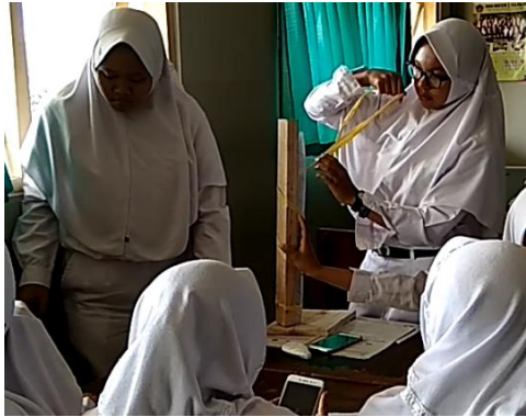
Figure 2. The students completing the project

In the Figure 2 above, it seems that students are completing projects related to the phenomenon of momentum. The last phase is assessment and evaluation results. In this phase, each group discussed and presented the observations that have been made as shown in Figure 3.